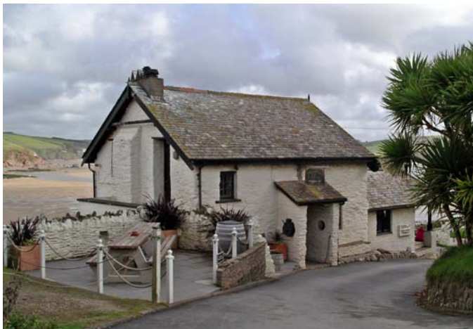
Pilchard Inn from the back

We were told the Pilchard is a re-badge but it was very good warranting a CAMRA 3½