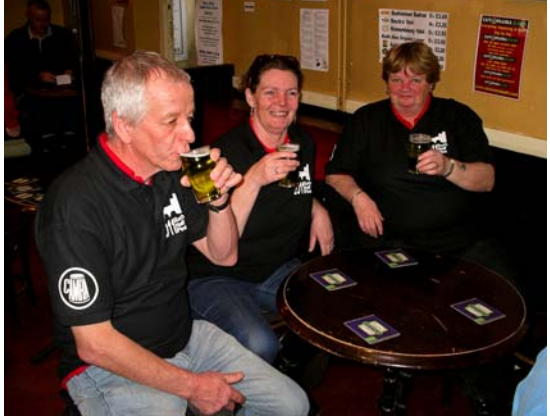
The Sign of Spring Toast

Butcombe, Bitter 4.0% Otter, Otter Ale 4.5% Stonehenge, Sign of Spring 4.6% Hopback, Summer Lightning 5.0% Abbey Ales, Bellringer 4.2% Cotswold Spring, Winter Royal 5.8% RCH, Pitchfork 4.3% Moor Beer Co, Old Freddy Walker 7.3%