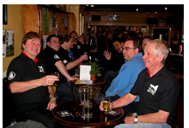
Group in The Bell