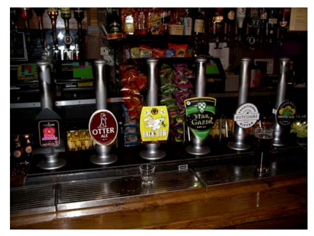
Pumps at The Pig