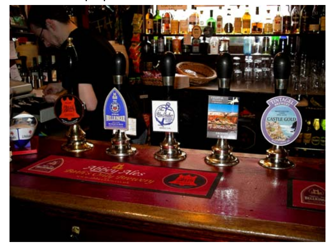
In addition to 2 x 18's of Bass, the 5 hand pulls normally offer 2 Abbey Ales, the Abbey Cider and 2 guests but today they were having a festival to honour the Cornish patron saint – St Piran.

The building itself is far older than its rather grander neighbours. It was one of two or three buildings on the Vineyards when work began on the Paragon. The entrance was moved to the front of the building to allow the work force building the Paragon to collect their pay from the paymaster in The Star. The pub retains many of it's original features including the 19th Century bar fittings and the numbered rooms, compulsory when Licensing Laws required all rooms to be numbered and listed for their purpose.