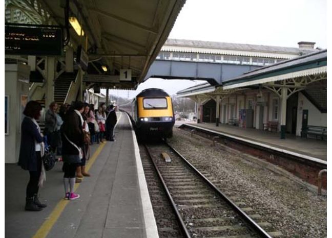
11:10 to Bath, a good old HST

Group Saver day returns cost £2-40 each, bargain!