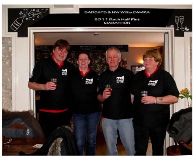
SADCATS at The Griffin.