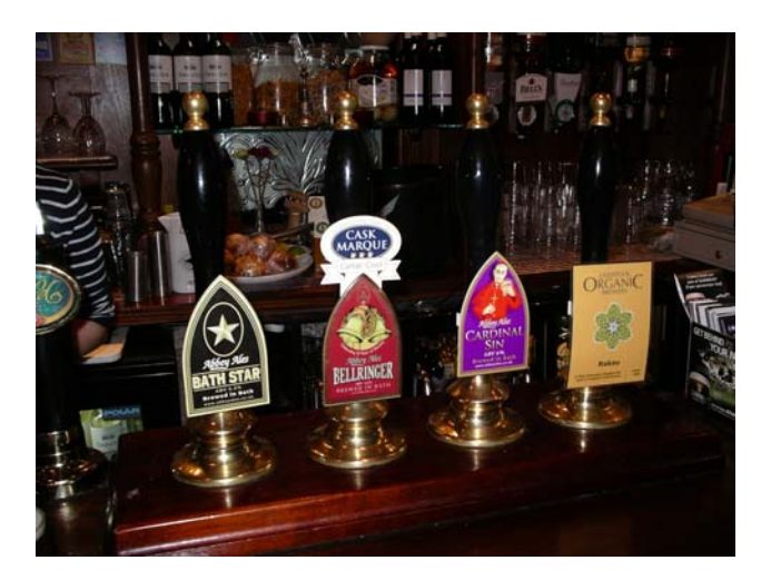
Abbey Ales, Bellringer 4.2% Abbey Ales, Bath Star 4.5% Abbey Ales, Cardinal Sin 6.0% Liverpool Organic, Rakau 5.0%

Now in the hands of Bath's Abbey Ales the 4 hand pulls dispense 3 of their beers and one guest. Small cosy bar, but same as last time \sim no interaction with the barmaid. More room to eat upstairs and all meals are a reasonable £7-95.