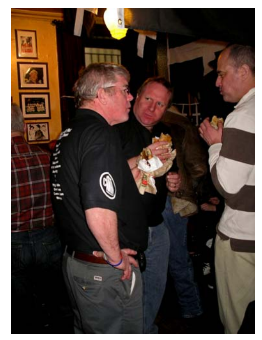
Time for a Pasty?