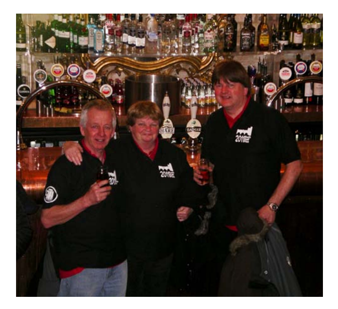
The Assembly Inn

Hall & Woodhouse, First Gold (Best) 4.1% Hall & Woodhouse, Tanglefoot 4.9% H&W, Hopping Hare 4.5% (Seasonal)