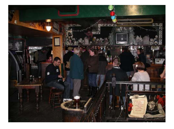
1 5 The Volunteer Rifleman's Arms

Bath Åles, GEM 4.1% Wadworth, 6X 4.3% Dawkins, Brassknocker 3.8% Otter, Otter Head 5.8% Wychwood, Hobgoblin 4.5%